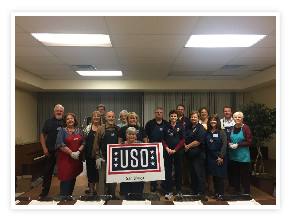
November 27<sup>th</sup> North County Corvette Club and the downtown Lions Club

Every Tuesday USO San Diego offers a hosted dinner at their Downtown Center. These weekly dinners give service members and military families an opportunity for a night out free of cooking, cleaning and dish duty! Different volunteer groups from local businesses, corporations and civic Groups serve up a home-cooked meal each week. Dinner is served between 6:00 p.m. - 6:30 p.m. On many occasions, the evening will also include special drawings, providing individuals a chance to win a gift certificate to a local restaurant or other prizes. The dinner is first come, first served up to 215 participants.